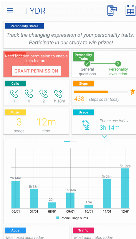
Figure 1: The main screen of TYDR that visualizes daily and weekly summaries of collected data.